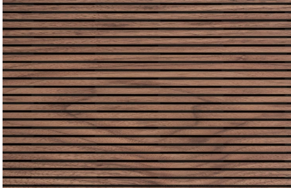
Absorption data for Groove 5 -H (EN 354: 2003)

3mm slot width, 5mm slat width (higher perforation than Groove 5)